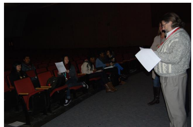
Students anxiously wait to receive their prizes for Perfect Attendance.