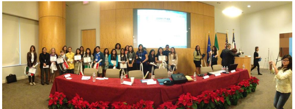
Italian students proudly pose after being presented their awards at the Italian Consulate.