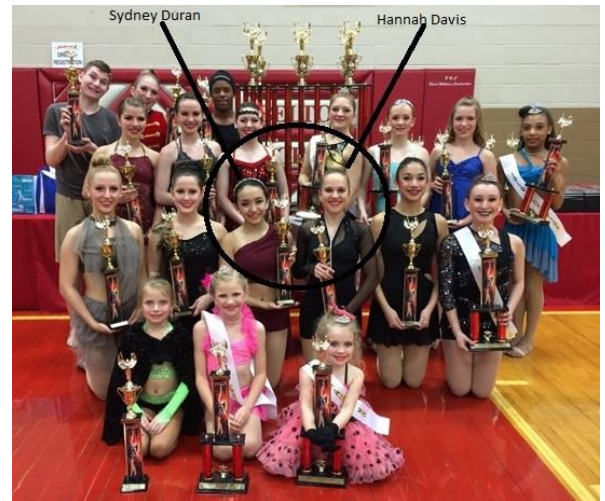
Belles proudly pose after their victory in the first HISD Dance Team Competition.