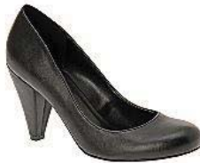
Moderate heeled shoes