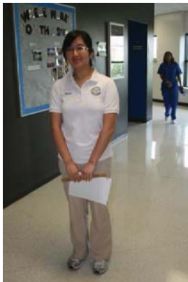
DeBakey Polo and khaki pants