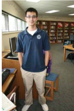
DeBakey Polo and khaki pants