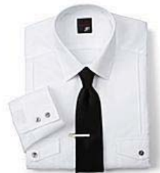
Shirt and tie