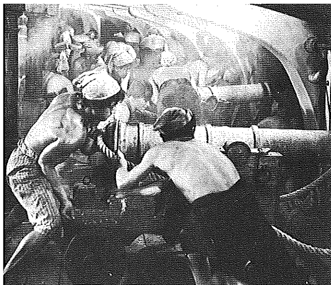
Action on the gunnery deck of an American frigate during the Revolutionary War.

Meanwhile, the Second Continental Congress had signed the Declaration of Independence on 4 July 1776,