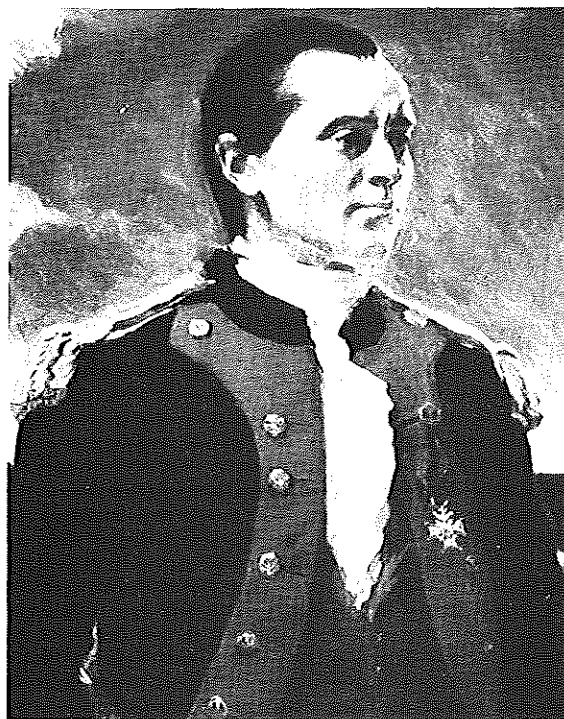
John Paul Jones was one of the first naval heroes of the new American Republic. As the inscription on his tomb under the Naval Academy chapel reads, "He gave to our Navy its earliest traditions of heroism and victory."

One year later, Jones was given command of an old forty-two-gun converted French merchantman, which he renamed the Bonhomme Richard in honor of Benjamin Franklin, who had written Poor Richard's Almanac . In August 1779 Jones sailed in command of a small squadron that included the American frigate Alliance , which