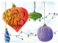
TH Rogers MS