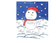
School at St. George Place ES