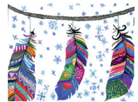
Young Women CPA