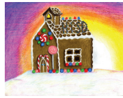
High School for Law and Justice