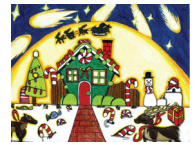
Park Place ES