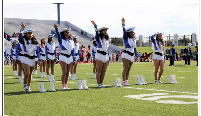
2018 Westside Yearbook will chronicle the year's best highlights and memories.