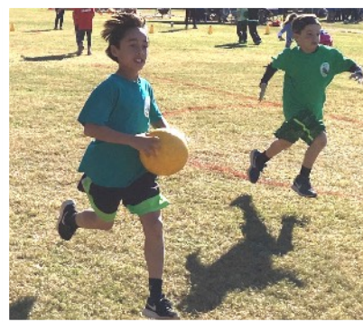
DD running during a soccer game.

When you're sprinting, lean forward and run on your toes. Pump your arms back and forth instead of side to side. While running, take small but fast steps. On long runs, pace at the beginning and sprint at the end. This is called a negative split. After the race, stretch well and celebrate with your friends!