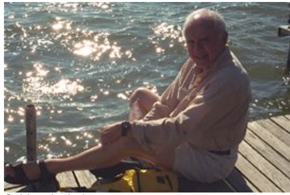
Subject is dark

Learn more about composing people pictures