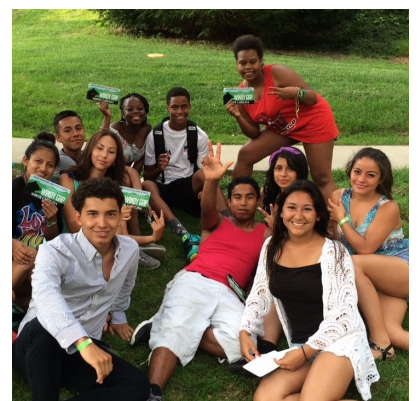
The Young Life Club