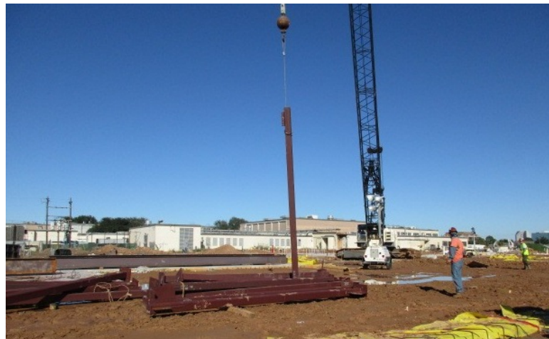
The first construction beams were put into place on the brand new Lee High School campus in December. Workers do not expect any delays as they continue to push towards a 2017 completion.