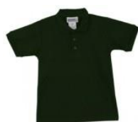
Green Polo Shirt with Collar

Our school community has set high standards for appropriate attire and personal cleanliness. Below are the required uniform guidelines: