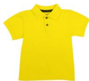
Yellow Polo Shirt with Collar