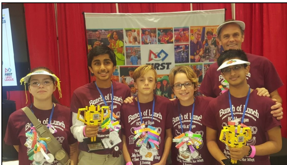
Our Robotics team “A Bunch of Lunch” won 1st Place in Robot Performance and Mechanical Design category at the South Regional FLL championship out of a total of 260 teams. Nicely done!