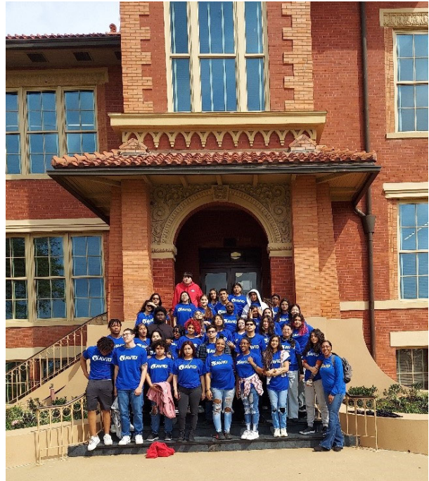
AVID students from Scarborough High School tour Blinn College.