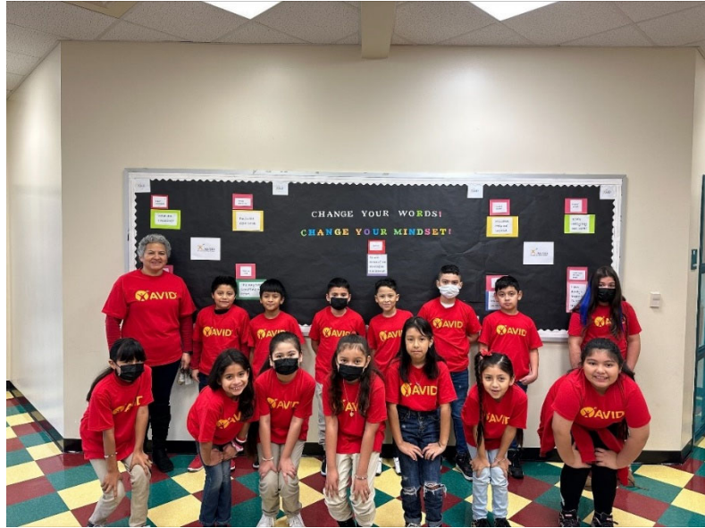
Seguin Elementary third graders

AVID is designed to increase schoolwide learning and performance. To achieve this goal, AVID trains educators in AVID strategies that build collective educator agency by insisting on rigor, breaking down barriers to student success, aligning the work throughout the school, and advocating for students. As a result, AVID students will build the skills to access and succeed in rigorous coursework, develop increased agency, and participate in opportunity knowledge-building activities that will prepare them for postsecondary success.