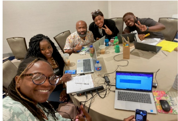
AVID staff at Summer Institute 2022.