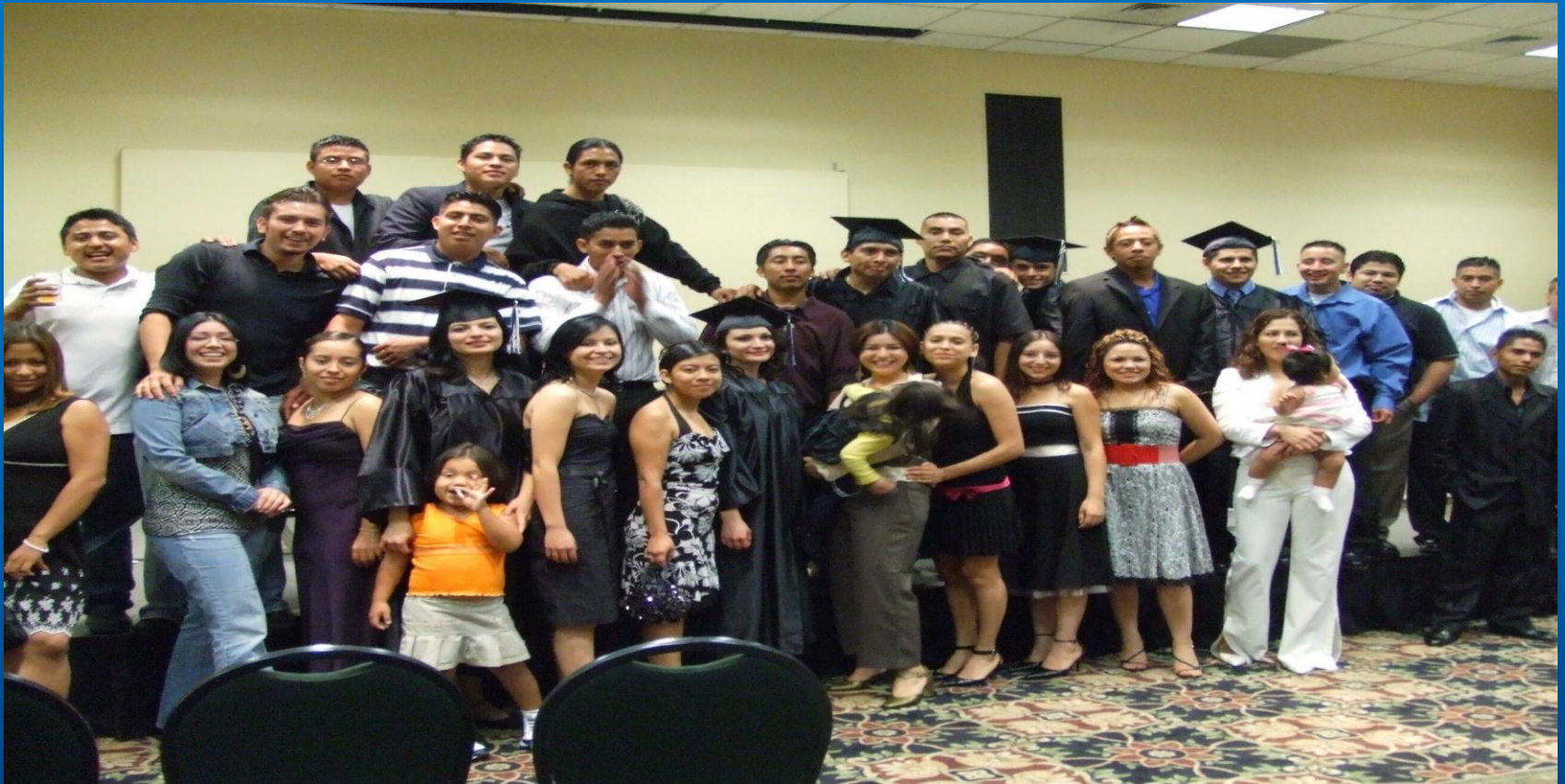
Students , Friends and Families celebrate at our first graduation.