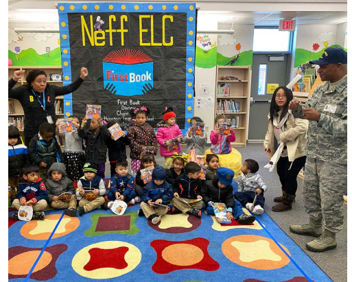
Volunteers from First Book at NEFF ECC.