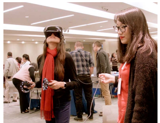
Microsoft Partners at Hattie Mae White during Coding Bash for HISD students and staff.