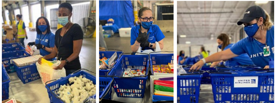
United Airlines Volunteers at the United Airlines Cargo Facilities

United Airlines helps to prepare HISD students to take flight for the 2020-2021 school year by providing them with essential hygiene care packages and school supplies.