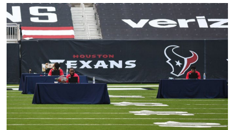
Houston Texans players at NRG preparing to read virtually to HISD students