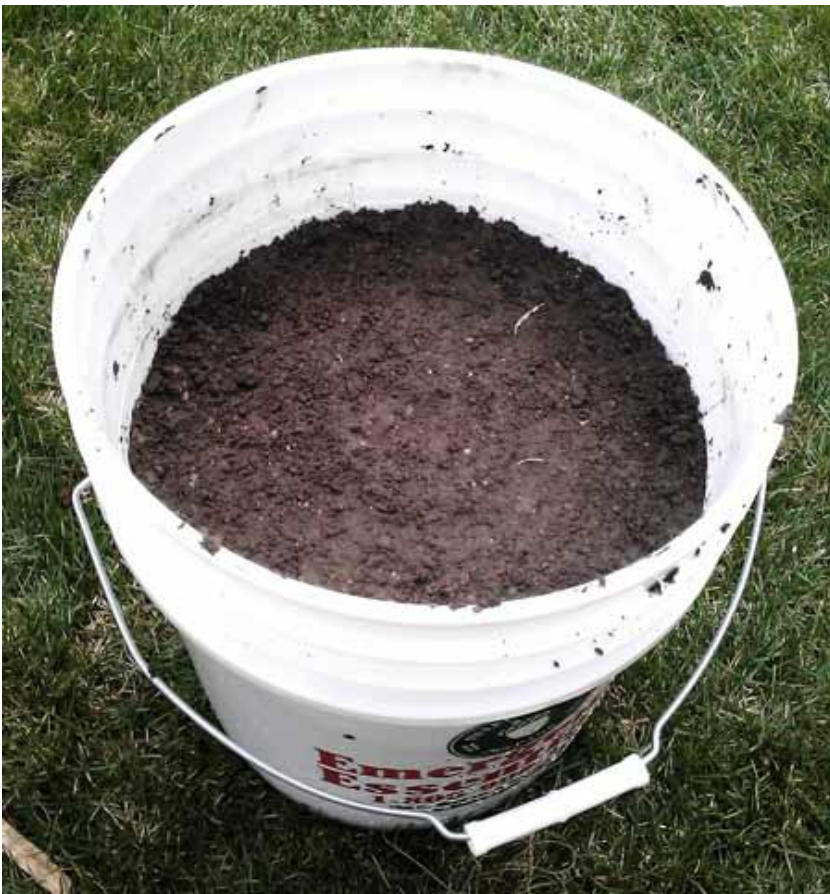
Step Five: Another Towel