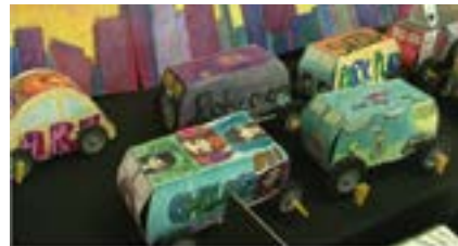
Play "Feast of Art" Video

captured through video, can be viewed by clicking the picture to the left or retrieved from HISD (Houston Independent School District, 2017).