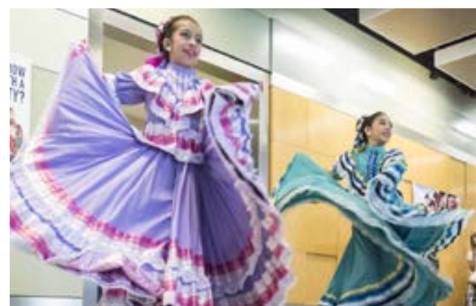
Figure 4: Stevenson students perform at Board auditorian naming