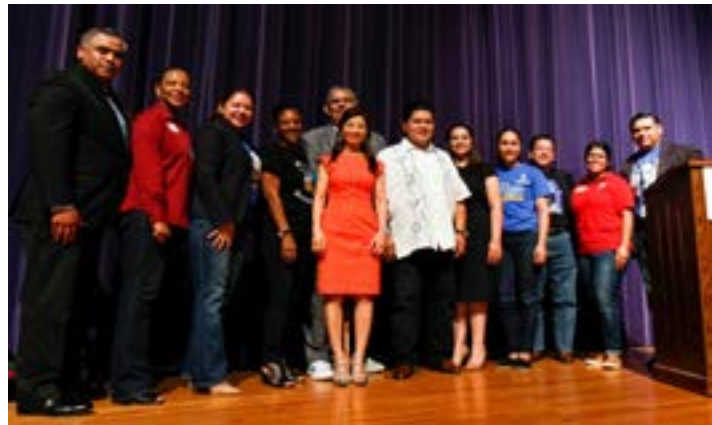
Figure 14: Administrators and trustee from Chavez feeder schools, and superintendent culminating "A Feast of Art" event, spring 2017

provement. Some comments are presented in Tables 5a and 5b. In general, survey respondents emphasized benefits of the initiative related to collaboration and administrative support. A teacher noted new networking opportunities with other fine arts teachers in the east area. Other respondents perceived growth in students' fine arts abilities and opportunities to engage in different types of fine art activities. A teacher stated being a part of the decision-making process to increase fine arts access for students. Another teacher expressed a sense of value as a fine arts teacher, considering the expanded communication among teachers of core content areas at the school.