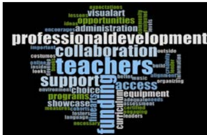
Figure 7: District III - East Area teachers' perceptions of fine arts needs, fall 2016