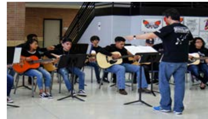
Figure 9: Chavez guitar ensemble performance, spring 2017

programs are, typically, structured around lessons, instrument demonstrations, and performances using musicians and teaching artists who are embedded within communities ( Figure 9 ). Further, well-known plays and operas were performed in targeted east area schools by the Houston Grand Opera, such as "The Princess and the Pea" and "The Barber of Seville."