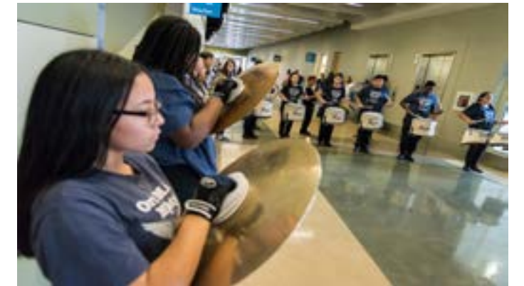
Figure 11: Ortiz students perform at district-level ceremony, August 2017

from the community coached and modeled instructional practices in choir classes at Chavez, Ortiz, and Rucker and in general music classes at Lewis. The visual arts teachers at Bonner and Lewis collaborated on visual arts projects. These teachers returned to their schools to work on the projects. Co-teaching occurred in the dance program at Chavez and Ortiz. To strengthen alignment of their instructional program across academic levels, orchestra teachers at Chavez and Ortiz met and observed each others' classrooms in spring 2017. Chavez, Park Place, and Bonner shared a band teacher in spring 2017. Band teachers from Stevenson, Ortiz, and Chavez joined together to plan collaboration for the 2017–2018 school year. Students at Ortiz participated in the band camp. Plans to hold