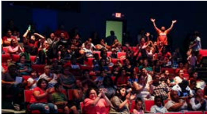
Figure 13: Audience celebrate students' live performances