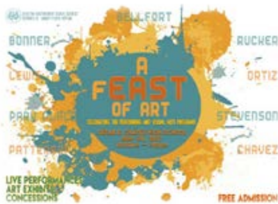
Figure 1: "A Feast of Art" Fine Arts Showcase, May 2017

problem solving skills (Catterall, 2007), and educational aspirations (Marsh & Kleitman, 2002). Non-academic benefits of arts participation for students have been