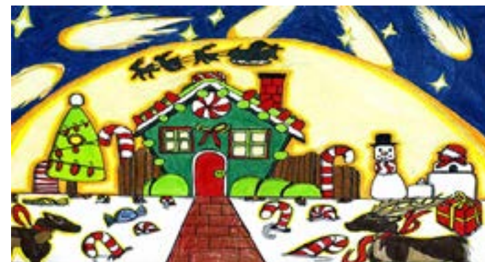
Figure 10: Park Place fourth grade students' submission in holiday card contest

Phase 3 was comprised of five components: (1) collaboration (2) coaching, (3) community outreach, (4) donations, and (5) performing off-campus. Specifically, HISD fine arts specialists