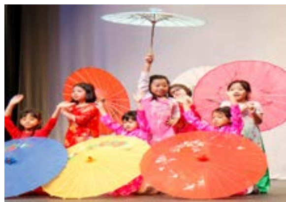
Figure 2: Park Place first-grade students present "Spring Butterfly"

".... As the trustee for District III, I saw the need for a fine arts program that progressively develops our students' artistic abilities from elementary school to middle school and finally to high school.... continuity of instruction is critical to help our students reach their fullest potential." (Manual Rodriguez, 2017).