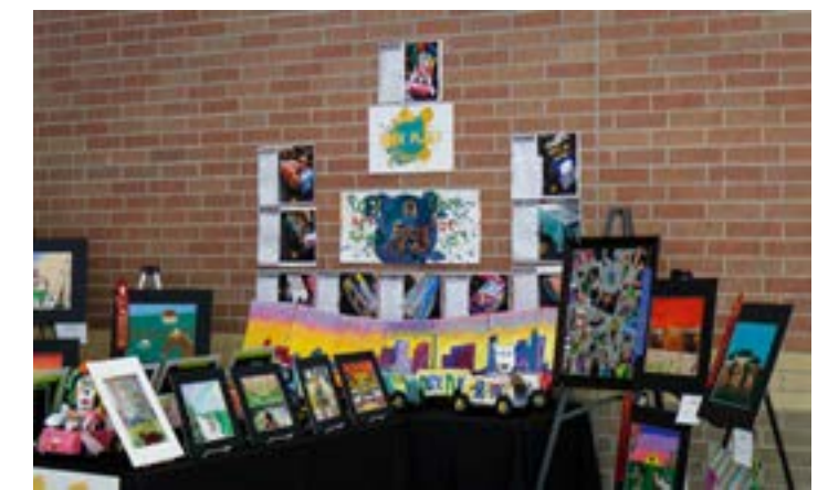
Figure 12: Display of students' art in District - III - East Area, 2017

from the community coached and modeled instructional practices in choir classes at Chavez, Ortiz, and Rucker and in general music classes at Lewis. The visual arts teachers at Bonner and Lewis collaborated on visual arts projects. These teachers returned to their schools to work on the projects. Co-teaching occurred in the dance program at Chavez and Ortiz. To strengthen alignment of their instructional program across academic levels, orchestra teachers at Chavez and Ortiz met and observed each others' classrooms in spring 2017. Chavez, Park Place, and Bonner shared a band teacher in spring 2017. Band teachers from Stevenson, Ortiz, and Chavez joined together to plan collaboration for the 2017–2018 school year. Students at Ortiz participated in the band camp. Plans to hold