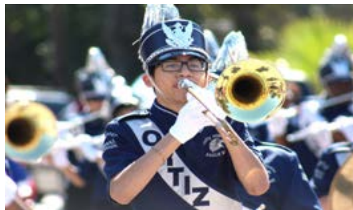
Figure 3: Ortiz MS band students march at community parade

Austin feeder pattern in subsequent years. A five-year expansion of the arts in District III is designed to enhance students’ access to arts education, while building inventory at each of the targeted schools in the area. The fine arts program at participating schools at baseline (2016–2017) can be found in Table 1.