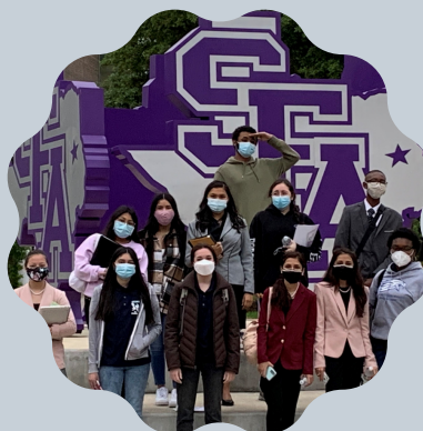
UIL Competitors at Stephen F Austin University