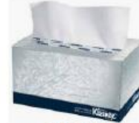
Box of Kleenex