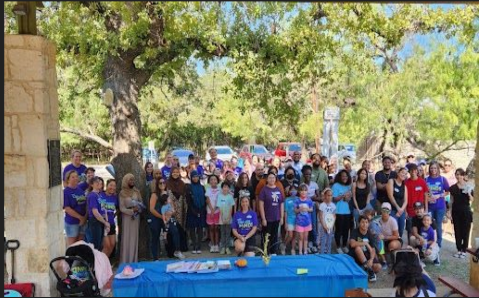
San Antonio Social