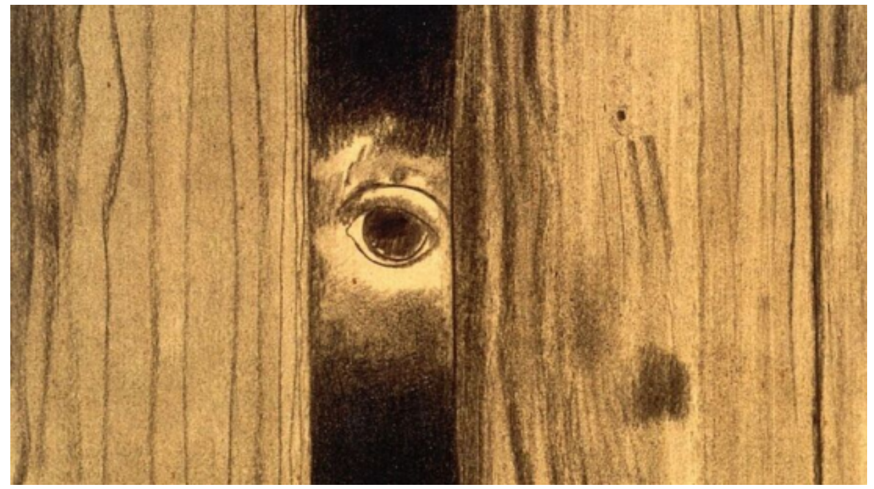
Illustration by: Odilon Redon/Wikimedia Commons

By Edgar Allan Poe on 10.01.19 Word Count 2,198 Level MAX