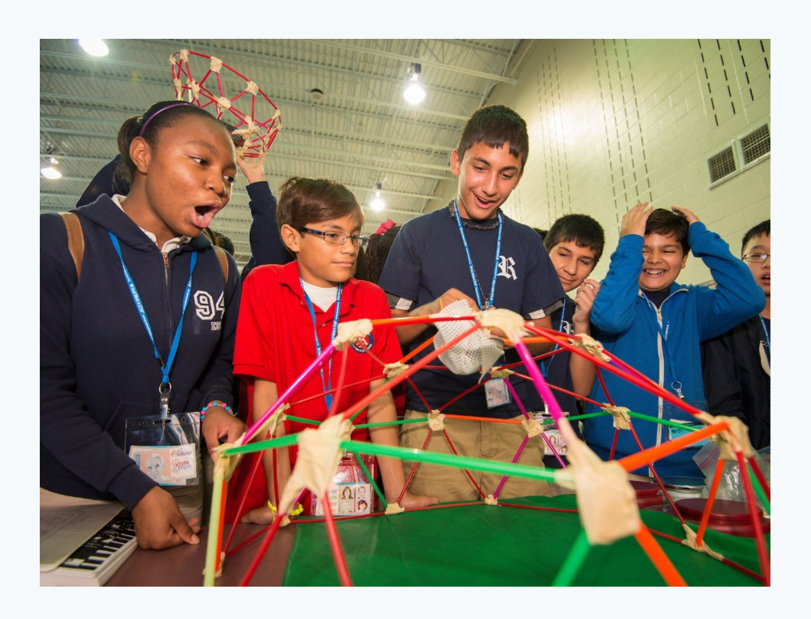
Houston ISD Gifted & Talented Education and Services Family Handbook