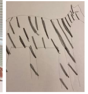
Picture of counting animal legs with permission from Ms. Coronado taken with iPhone