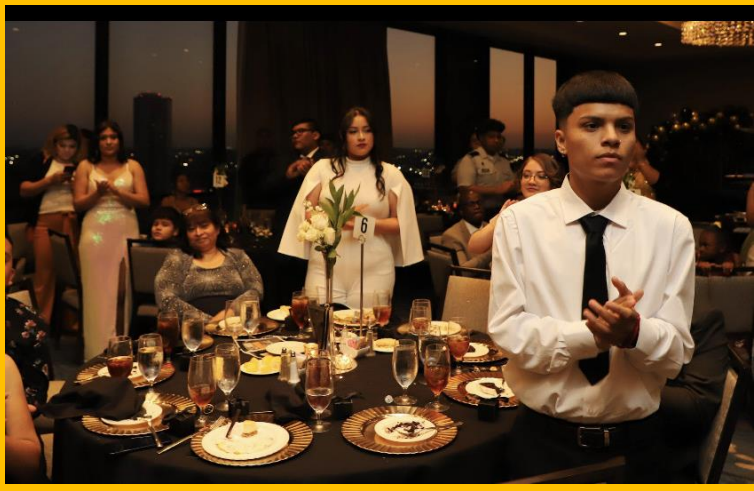
Crowd, consisting of cadets and guests, applauding during the program.