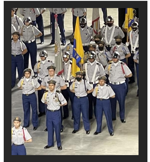
View from the stands.

On the 23 rd of April, fifty cadets visited the HISD Delmar Fieldhouse for the Final Review. The Final Review is a yearly celebration of the accomplishments of all battalions through the year.