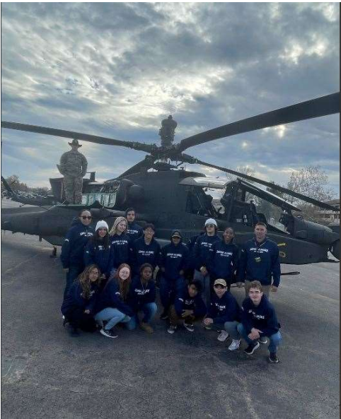
Lamar JROTC 7 th Battalion