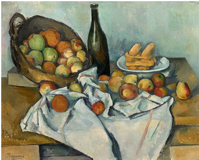
The Basket of Apples