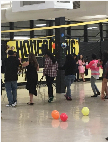
The Sam Houston MSTC Homecoming dance kicks off with a line dance.