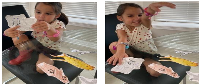
Picture of counting animal legs with permission from Ms. Coronado taken with iPhone