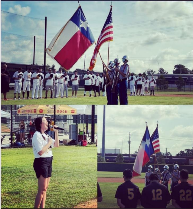
Saturday, August 28, 2021 Alumni Game at Sam Houston Field

The Alumni game was graduated members of Tiger Nation from as early as 1992 to as recently as 2020 playing an exhibition game on campus and celebrating the legacy of Sam Houston and all it represents.