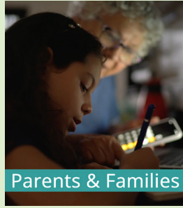
Parents & Families